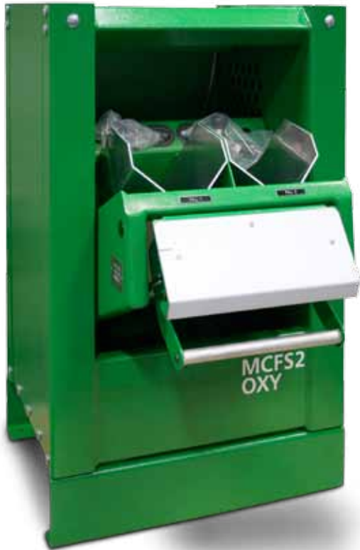
Two Position Oxygen Fill Station